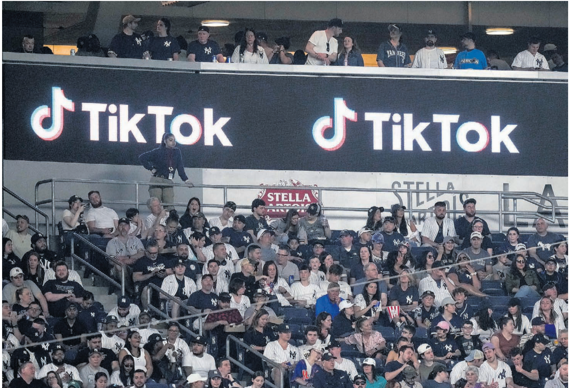
Fans sit under a TikTok ad at a baseball game at Yankee Stadium, April 14, 2023, in New York.